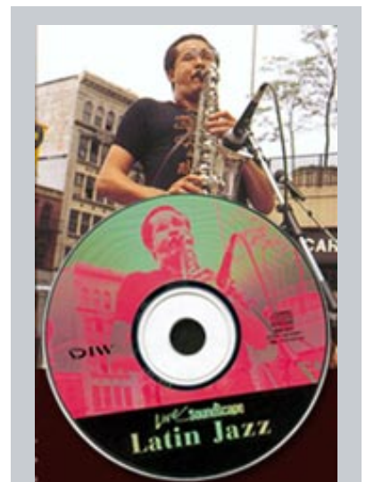
LIVE ...Soundscape PAQUITO D'RIVERA

Havana-born (1948) saxophonist and clarinet player, Paquito D'Rivera was one of the founding members of two of the most important bands in the history of Cuban music: Orquesta Cubana de Musica Moderna and Irakere. He always had the musical curiosity for non-Cuban music but it was not until his defection to New York City (in 1981) that he was able to participate in the musical interactions that would change the character of Latin Jazz. "The "seeds" of the new turn of Latin Jazz that we are still enjoying are in the historic jam sessions in a loft in NY called Soundscape. I contributed but I also learned about Brazilian, Argentinian, and Puerto Rican music as well as the new developments in jazz." Paquito quickly became the leader of bands that reflected this same fertile multi-ethnic interaction. "The bands that I formed during the 1980's were 'escuelitas' (schools) with musicians coming from very different places and musical backgrounds in Latin America. For example, Danilo Pérez (Panama),